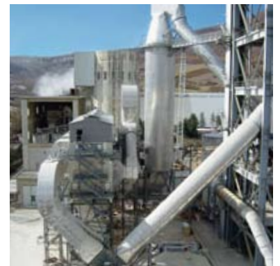
CEMENT WORKS, Italy PREHEATER KILN

The perfect design of the evaporative cooler and its adaptation to the target specifications of the installation are decisive elements in reaching the maximum degree of efficiency and a long life of the entire plant. Our engineers' experience guarantees the right technological solution to create the correct physical conditions.