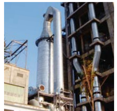
CEMENT WORKS, Vietnam PREHEATER KILN